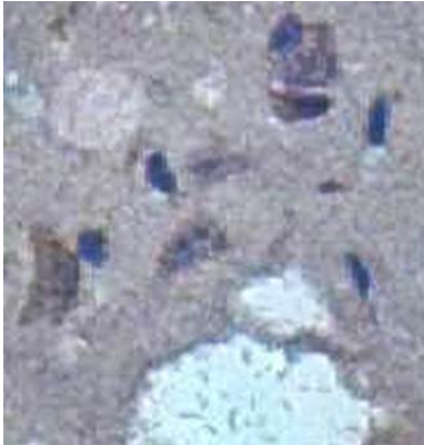
Immunohistochemical analysis of formalin-fixed paraffin embedded fetal brain staining using HPCAL4 antibody