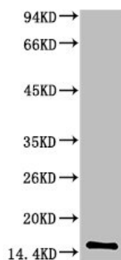
Western blot analysis of Human Serum using Transthyretin antibody