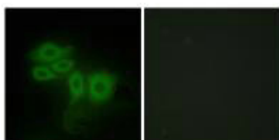
Immunofluorescence analysis of HepG2 cells using SLK antibody