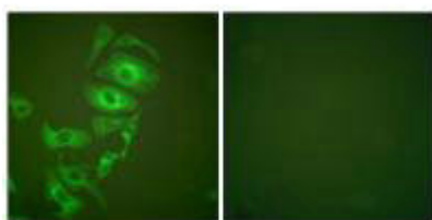
Immunofluorescence analysis of HepG2 cells using KRT17 antibody