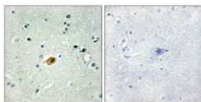
Immunohistochemical staining of Human brain tissue using SOX8 antibody