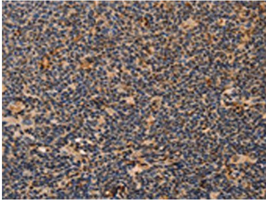
Immunohistochemistry of paraffin-embedded Human Lymphoma tissue using MPG antibody