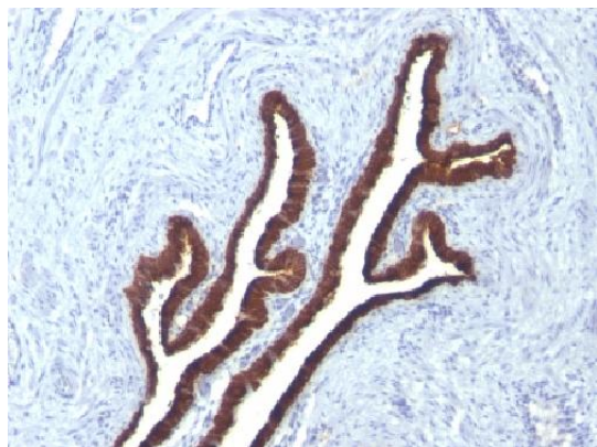
Immunohistochemical staining of human Ovarian Carcinoma tissue using KRT7 antibody