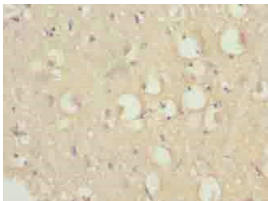
Immunohistochemical staining of human brain tissue using HERC6 antibody