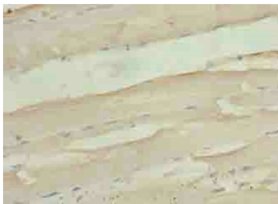
Immunohistochemical staining of human skeletal muscle tissue using PID1 antibody