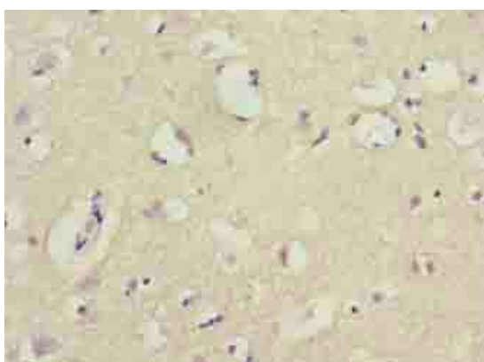
Immunohistochemical staining of human brain tissue using COX17 antibody