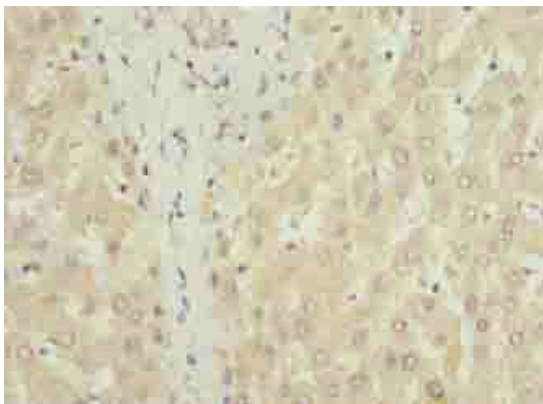
Immunohistochemical staining of human liver tissue using COX17 antibody