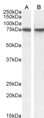
Western blot analysis of HeLa (A) and U2OS (B) cell lysate using SNX1 antibody