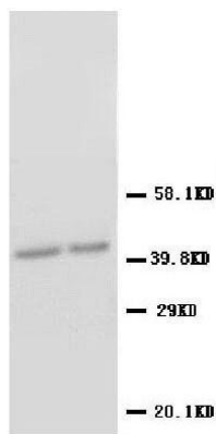
Western Blot analysis of rat liver lysate using Aquaporin 1 antibody