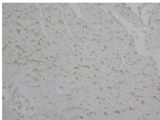
Immunohistochemical analysis of paraffin-embedded rat cardiac muscle tissue using Annexin 5 antibody