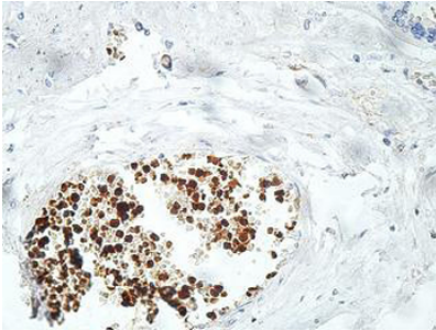
Immunohistochemical staining of formalin-fixed paraffin-embedded placenta showing nuclear staining with anti-ATF3 antibody