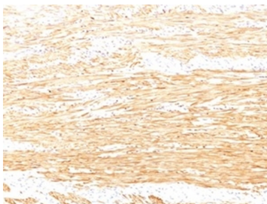
Formalin-fixed, paraffin-embedded human colon stained with Smoothelin Rabbit Recombinant Monoclonal Antibody (SMTN/2320R).