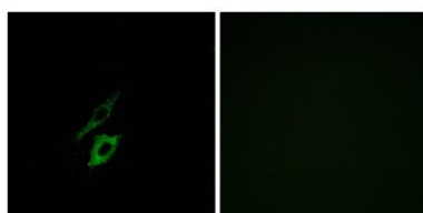
Immunofluorescence analysis of A549 cells, using FPR1 Antibody. The picture on the right is blocked with the synthesized peptide.

Background formyl peptide receptor 1(FPR1) Homo sapiens This gene encodes a G protein-coupled receptor of mammalian phagocytic cells that is a member of the G-protein coupled receptor 1 family. The protein mediates the response of phagocytic cells to invasion of the host by microorganisms and is important in host defense and inflammation.[provided by RefSeq, Jul 2010],