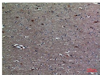
Immunohistochemical analysis of paraffin-embedded human brain, antibody was diluted at 1:100