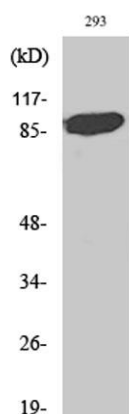
Western Blot analysis of various cells using Stat5a Polyclonal Antibody

The protein encoded by this gene is a member of the STAT family of transcription factors. In response to cytokines and growth factors, STAT family members are phosphorylated by the receptor associated kinases, and then form homo- or heterodimers that translocate to the cell nucleus where they act as transcription activators. This protein is activated by, and mediates the responses of many cell ligands, such as IL2, IL3, IL7 GM-CSF, erythropoietin, thrombopoietin, and different growth hormones. Activation of this protein in myeloma and lymphoma associated with a TEL/JAK2 gene fusion is independent of cell stimulus and has been shown to be essential for tumorigenesis. The mouse counterpart of this gene is found to induce the expression of BCL2L1/BCL-X(L), which suggests the antiapoptotic function of this gene in cells. Alternatively spliced transcript variants have been