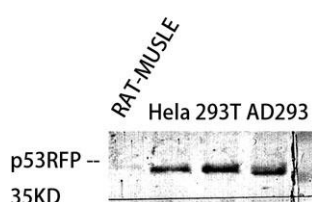
Western Blot analysis of various cells using p53RFP Polyclonal Antibody

caution:Lacks the His residue in the RING-type domain 2 that is one of the conserved features of the family.,domain:The RING-type zinc finger domain mediates binding to an E2 ubiquitin-conjugating enzyme.,function:E3 ubiquitin-protein ligase which accepts ubiquitin from E2 ubiquitin-conjugating enzymes UBE2L3 and UBE2L6 in the form of a thioester and then directly transfers the ubiquitin to targeted substrates such as LCMT2, thereby promoting their degradation. Induces apoptosis via a TP53/p53-dependent but caspase-independent mechanism.,pathway:Protein modification; protein ubiquitination.,PTM:Auto-ubiquitinated.,similarity:Belongs to the RBR family. RNF144 subfamily.,similarity:Contains 1 IBR-type zinc finger.,similarity:Contains 2 RING-type zinc fingers.,subunit:Interacts with UBE2L3, UBE2L6 and LCMT2.,tissue specificity:Broadly expressed, with lowest levels in brain, spleen and thymus.,