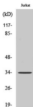
Western Blot analysis of various cells using Olfactory receptor 51D1 Polyclonal Antibody

Olfactory receptors interact with odorant molecules in the nose, to initiate a neuronal response that triggers the perception of a smell. The olfactory receptor proteins are members of a large family of G-protein-coupled receptors (GPCR) arising from single coding-exon genes. Olfactory receptors share a 7-transmembrane domain structure with many neurotransmitter and hormone receptors and are responsible for the recognition and G protein-mediated transduction of odorant signals. The olfactory receptor gene family is the largest in the genome. The nomenclature assigned to the olfactory receptor genes and proteins for this organism is independent of other organisms. [provided by RefSeq, Jul 2008].