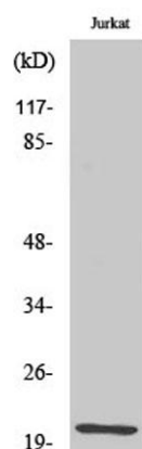
Western Blot analysis of various cells using HEN1/2 Polyclonal Antibody diluted at 1:1000 cells nucleus extracted by Minute TM Cytoplasmic and Nuclear Fractionation kit (SC-003, Invent biotech, MN, USA).

Background The helix-loop-helix (HLH) proteins are a family of putative transcription factors, some of which have been shown to play an important role in growth and development of a wide variety of tissues and species. Four members of this family have been clearly implicated in tumorigenesis via their involvement in chromosomal translocations in lymphoid tumors: MYC (MIM 190080), LYL1 (MIM 151440), E2A (MIM 147141), and SCL (MIM 187040).[supplied by OMIM, Nov 2002],