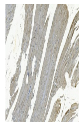
IHC analysis of GSTA4 using anti-GSTA4 a...