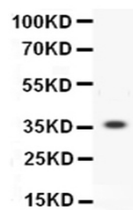
WB analysis of Recombinant Human MMP3 Pr...