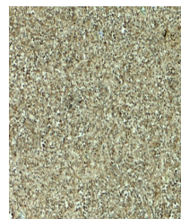
Immunohistochemistry of MALT1 in human s...