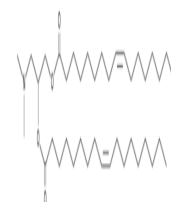
Chemical Structure (127512-29-2)